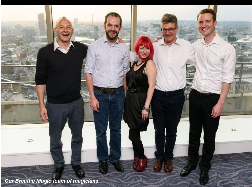
Our Breathe Magic team of magicians