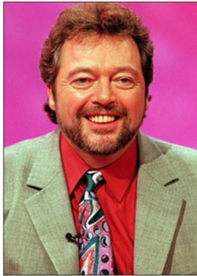
In Memory of Jeremy Beadle

On Saturday 2nd February 2008 magicians across the UK created their own Magic Moment. Thank you to everyone who took part in the very first National Day of Magic. Together we raised over £11,000 for a host of charities.